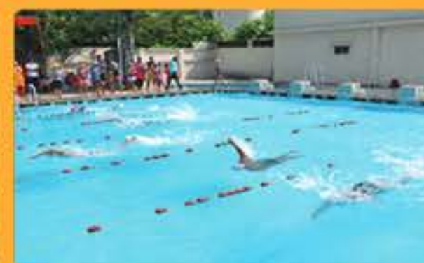
Focus on health and physical education

Freeship/Concession and scholarship up to 100% for deserving candidates.