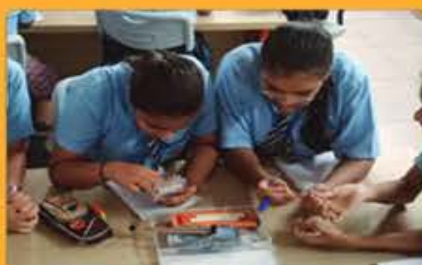
Technology integrated hands on-