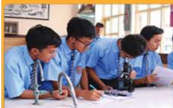
Discovery Based Learning