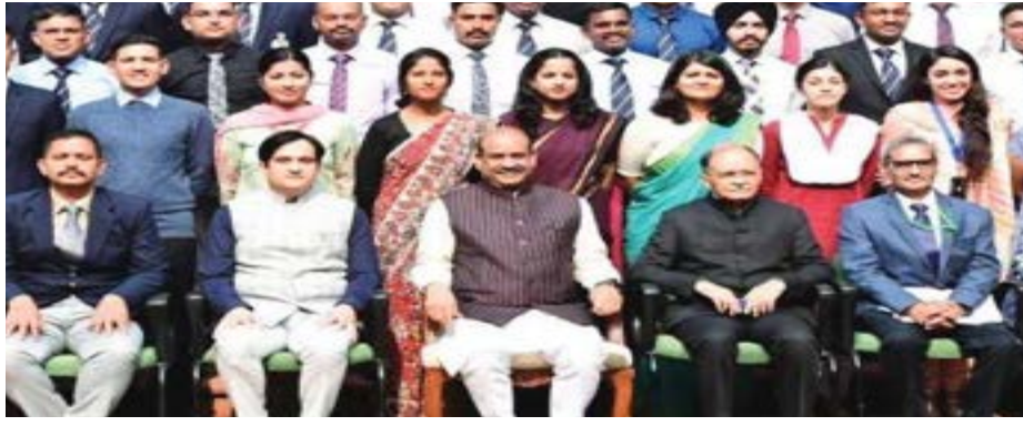
Lok Sabha Speaker Shri Om Birla inaugurated Appreciation Course in Parliamentary Practices and Procedures for Officer - Trainees of Indian Police Service (IPS) organised by Parliamentary Research and Training Institute for Democracies (PRIDE), Lok Sabha Secretariat on 15 November, 2023.

NEW DELHI: In Lok Sabha Speaker Shri Om Birla inaugurated the Appreciation Course in Parliamentary Processes and Procedures for the 75th Batch of Officer Trainees of the Indian Police Service undergoing training at the Sardar Vallabhbhai Patel National Police Academy, Hyderabad, organised by Parliamentary Research and Training Institute for Democracy (PRIDE) in Parliament Premises, today. Congratulating the Officer Trainees on their selection to the prestigious service, Shri Birla conveyed his optimism that they would discharge their responsibilities as custodians of justice and maintain law and order in the nation with utmost excellence. He emphasized that being chosen for the prestigious Indian Police Service was a testament to their dedication, intelligence and perseverance, as candidates who succeed in Union Public Service Commission examinations are globally recognized as outstanding in their respective fields. He emphasised that their role as Officers in the Indian Police Service provided them an excellent opportunity to contribute to the nation